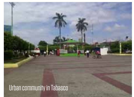
Urban community in Tabasco