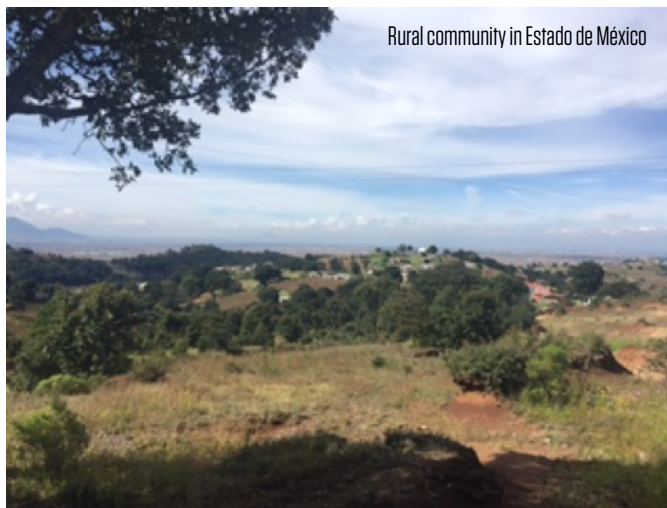
Rural community in Estado de México