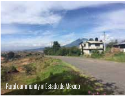
Rural community in Estado de México