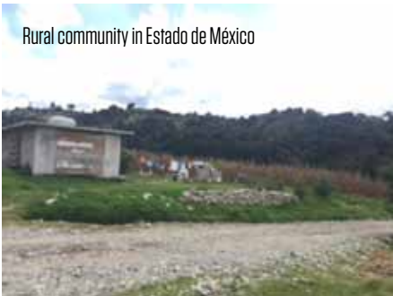
Rural community in Estado de México