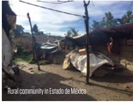
Rural community in Estado de México