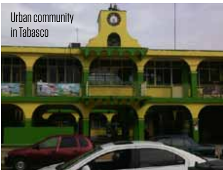
Urban community in Tabasco