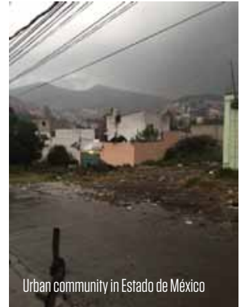
Urban community in Estado de México