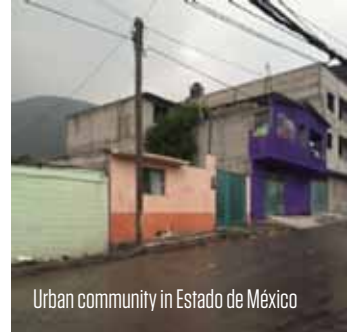
Urban community in Estado de México