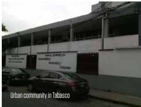
Urban community in Tabasco