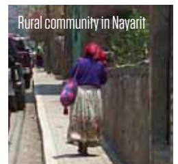
Rural community in Nayarit