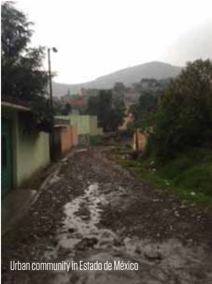
Urban community in Estado de México