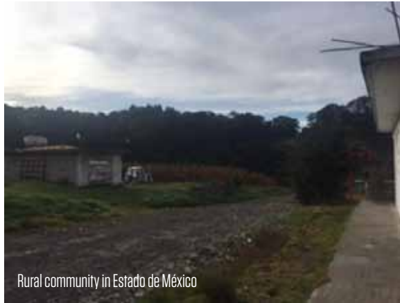
Rural community in Estado de México